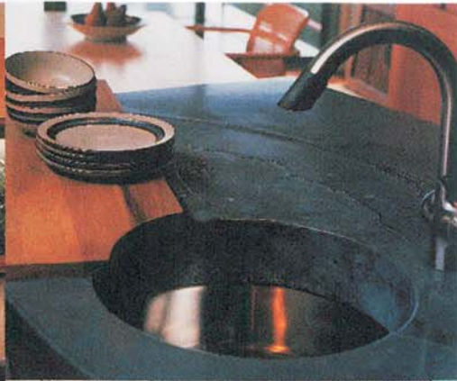
A concrete countertop, LEFT, can be paired with a wood cutting board. Concrete fabricators can create a multitude of colors, BELOW, by adding powdered and liquid pigments.